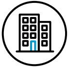
Building & Construction