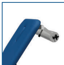
Paper Roll Holder