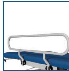
Fold Down Side Support Rails