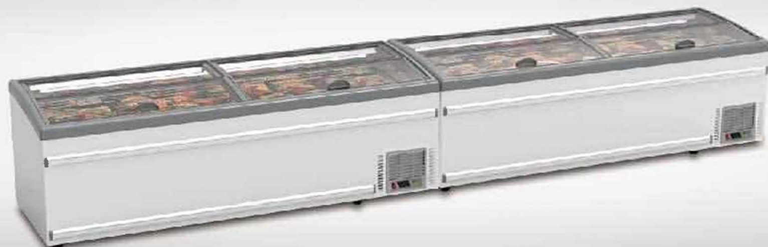
Horizontal combine style