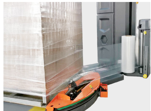
Automatic Cut & Clamp