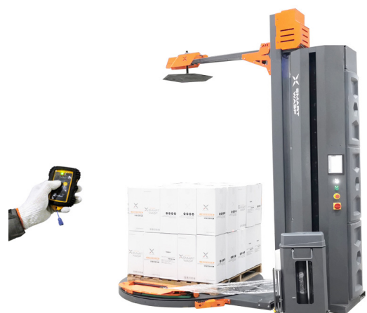
Remote Control Operation