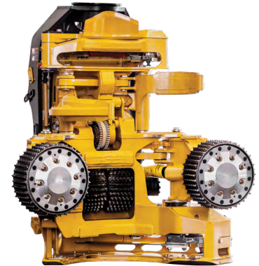
568 HARVESTING HEAD