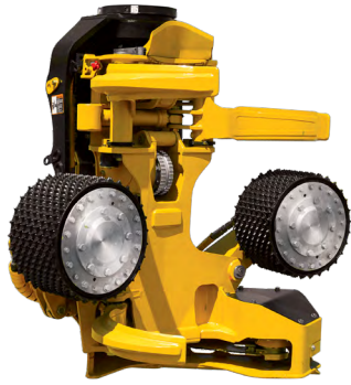
570 HARVESTING HEAD

Optimized harvester head hydraulics and robust, high quality components maximize performance and efficiency. Tigercat harvesting heads are equipped with large diameter hoses and large capacity valves to match the greater hydraulic flow and power of Tigercat harvester carriers. The H845E can be equipped with the Tigercat 570, 575 or 568 harvesting head to suit your tree size and application.