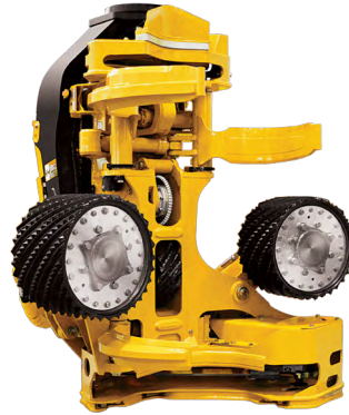
575 HARVESTING HEAD