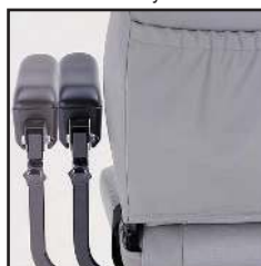
Width adjustable armrest