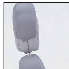
Height adjustable headrest