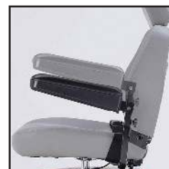
Height adjustable armrest