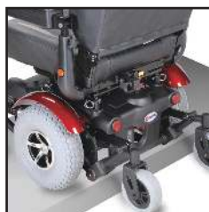
6" caster on front & rear for maximum stability