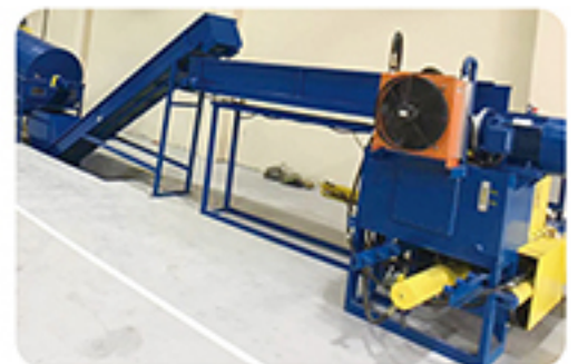
Material: Wood Shavings Area: DUBAI