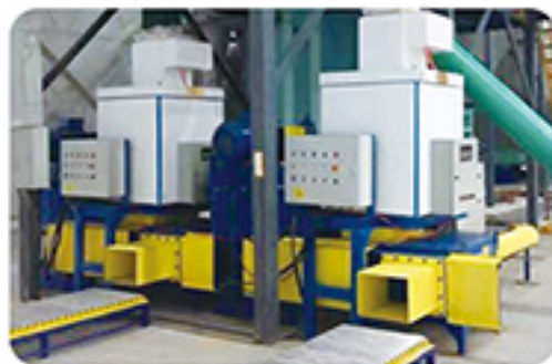
Material: Rick Husk Area: China