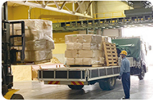
Material: Wood Shavings Area: Japan