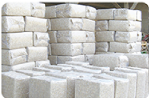
Material: Cottonseed Hulls Area: China