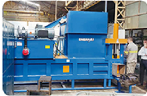
Material: Sawdust Area: USA