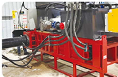
Material: Wood Shavings Area: USA