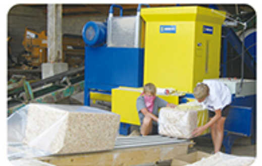
Material: Miscanthus chips Area: France