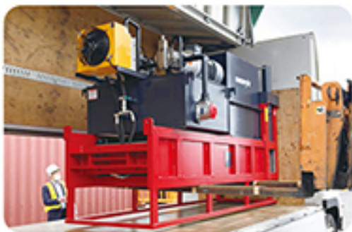
Material: Wood Shavings Area: Japan