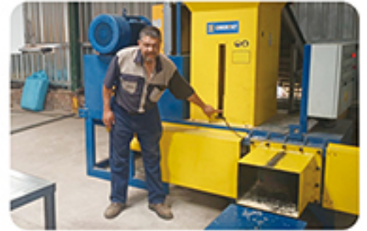
Material: Wood Shavings Area: South Africa