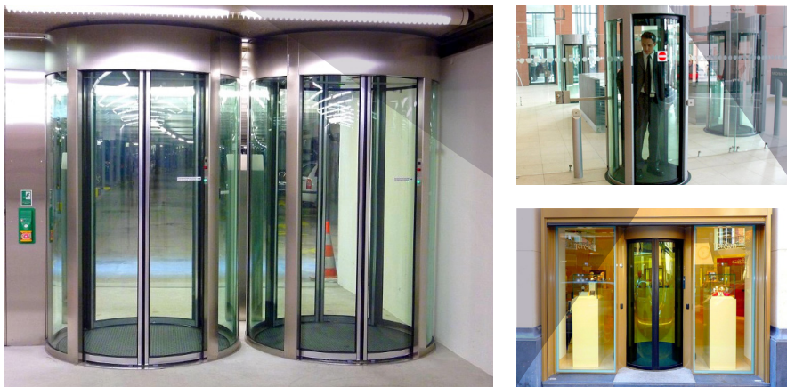
STANDARD CYLINDRICAL SECUREDOR

It features digital voice communication to help guide users through the portal, and there's a control panel with an intercom system if needed. There is a DDA Cylindrical SecureDoor option if your facility requires it, as well as internal lighting for a more user-friendly experience without jeopardising the security of your facility.