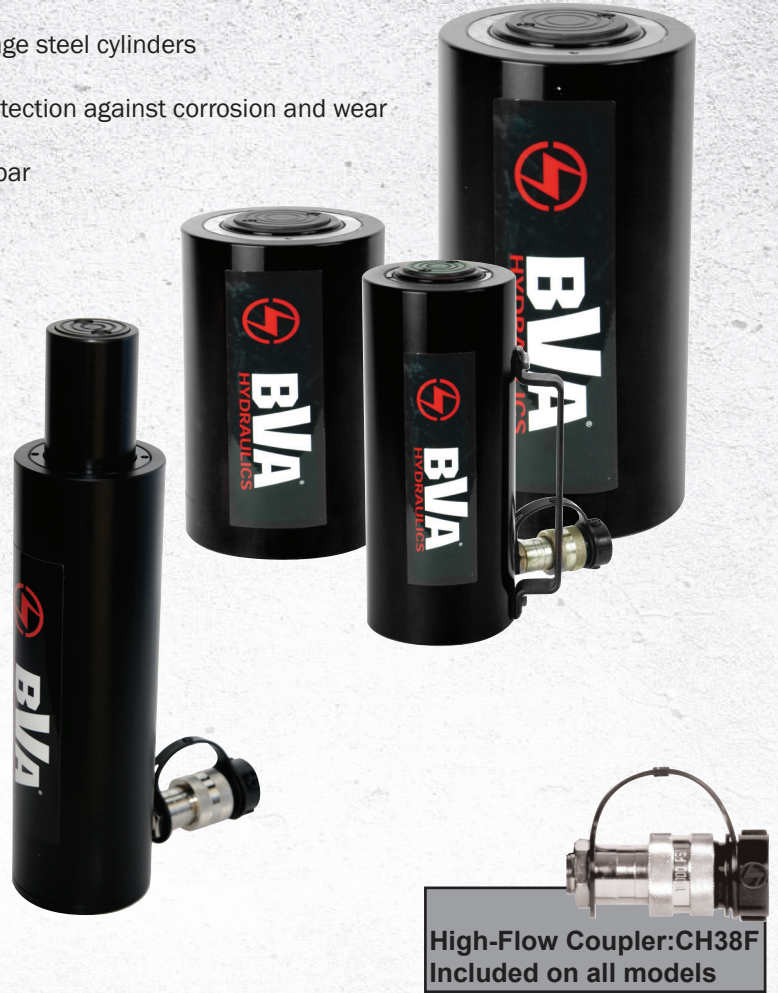
High-Flow Coupler: CH38F Included on all models