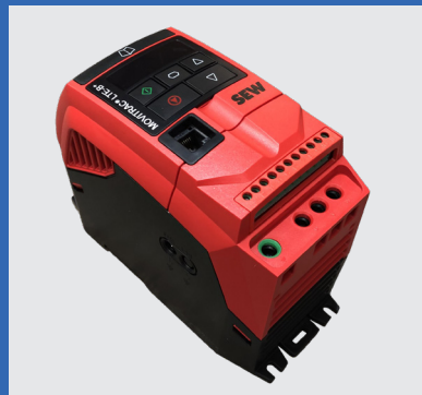
Variable Speed Mixing Function