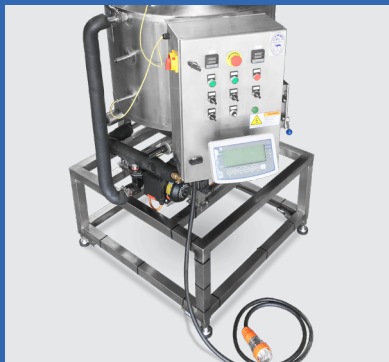
Batch Weight Scale Indicator