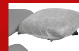
Disposable leg protections sold in units of 100 Ref. 2804-01