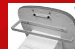
Roll holder Max. width 50 cm, diam. 20 cm Ref. 167-10