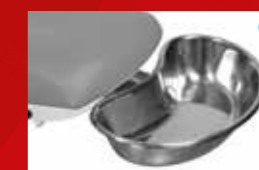
Clip-on stainless steel pan Ref. 2864-10