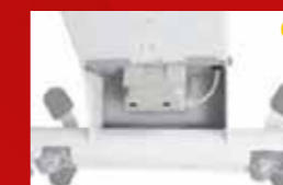
Battery Ref. 2892-01