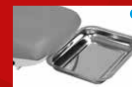
Square, clip-on stainless steel pan Ref. 2864-01