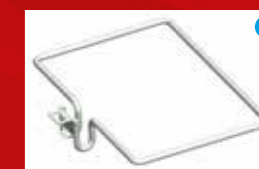
Waste bag holder Ref. 2874-01 10 rolls of 20 rubbish bags Ref. 962