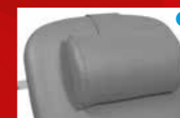
Adjustable headrest Ref. 2802-01