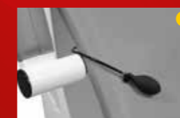
Lumbar support system with inflater bulb actuated by the patient Ref. 2880-01