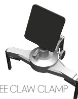
THREE CLAW CLAMP