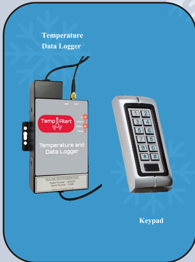
Temperature Data Logger