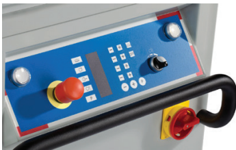
DR-ROBOT2-4/30A Control Panel Electronic with digital readout