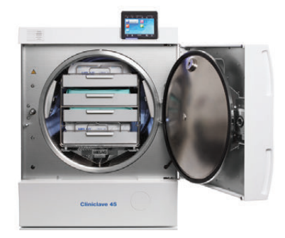
Four trays (each 31 x 5 x 59 cm)