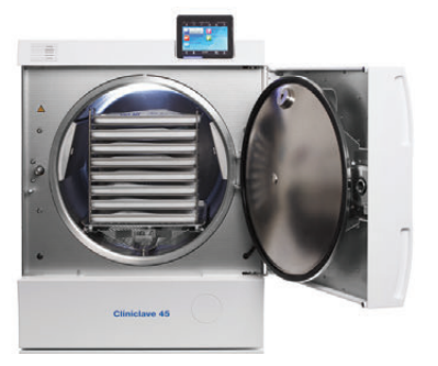
24 dental trays (each 19 x 2 x 29 cm)