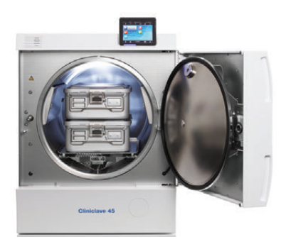
Two half containers 1/2 StE (each 30 x 15 x 60 cm)