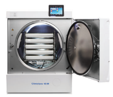
15 dental containers (each 31 x 5 x 19 cm)