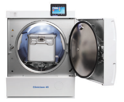
A whole sterilization container (W x H x D = 30 \times 30 \times 60 cm)