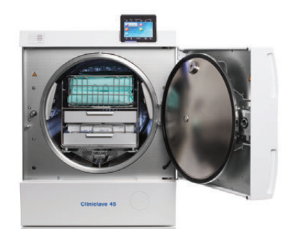
An instrument basket (W x H x D = 28 \times 14 \times 57 cm) and two trays (each 31 \times 5 \times 59 cm)