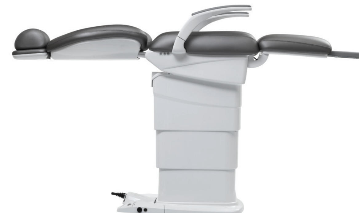
Motorized backrest height adjustment