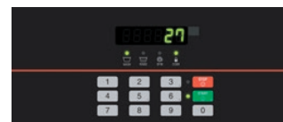
Quantum™ Gold Control