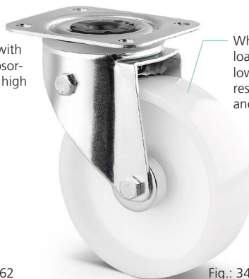
Fig.: 347S UFR 125 P62

Wheel UOJ: for high load capacities with low roll- and swivel resistances, non-marking and robust.