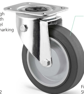
Fig.: 347S UOJ 125 P62

Wheel PJP SUPRATECH: non-marking and noise reduced.