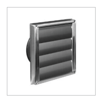
GRAVITY VENT - MARINE GRADE STAINLESS STEEL 100mm