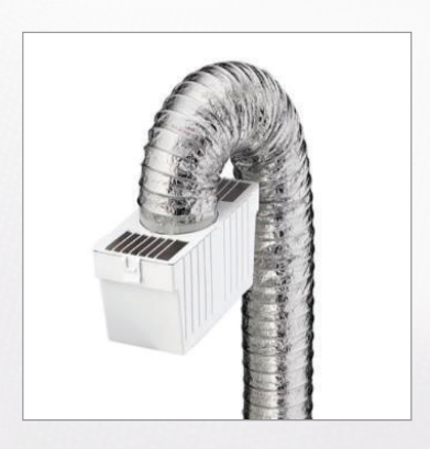
INDOOR LINT FILTER TRAP*