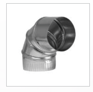
ADJUSTABLE ELBOW 0-90 DEGREES - 100mm