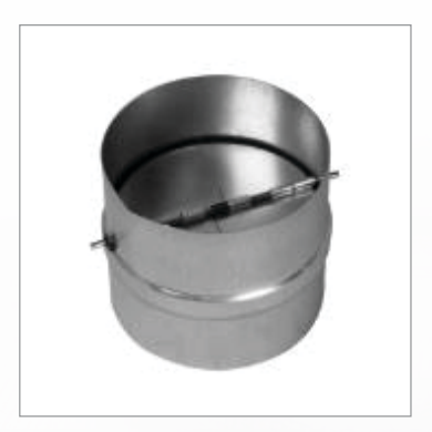
DRAFT BLOCKER 100mm