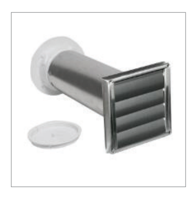
100mm THROUGH WALL KIT (STAINLESS STEEL)