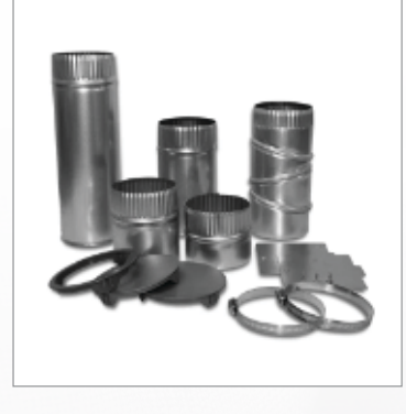
INTERNAL SIDE FLU KIT - TO CHANGE DRYER VENTING