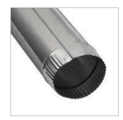
CLIP SEAM PIPING 100mm x 900mm