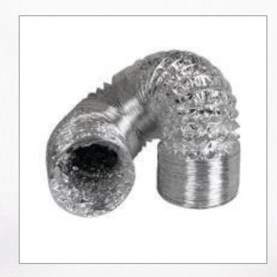
FLEXIBLE DUCTING* 100mm x 2.4m