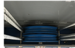
Heavy Duty Cable Pulleys