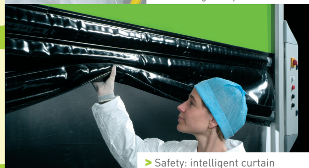
> Safety: intelligent curtain

The door has a flexible curtain with horizontal stiffeners guided in vertical guides. Pressure is evenly distributed over the whole curtain, pushing it against the guides to obtain a good seal. This design allows the door to operate even under pressure differences.