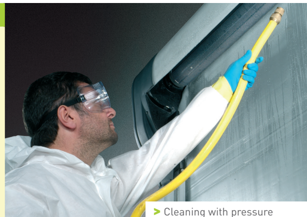
> Cleaning with pressure

The curtain of the R Food 5 door is made of food grade material, adapted to the food industry.