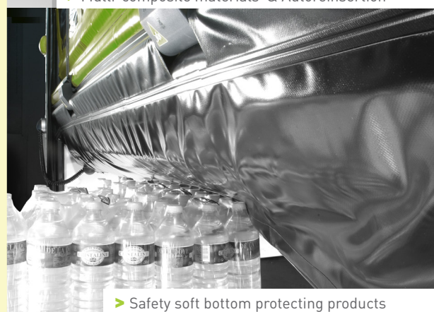
> Safety soft bottom protecting products

The direct drive motor with proven reliability provides long lasting performance. This technology avoids the use of chains and reduces maintenance. General wear is reduced as the door operates with only 5 moving parts (motor, gearbox, limit switch, winding shaft, rotating sleeve).