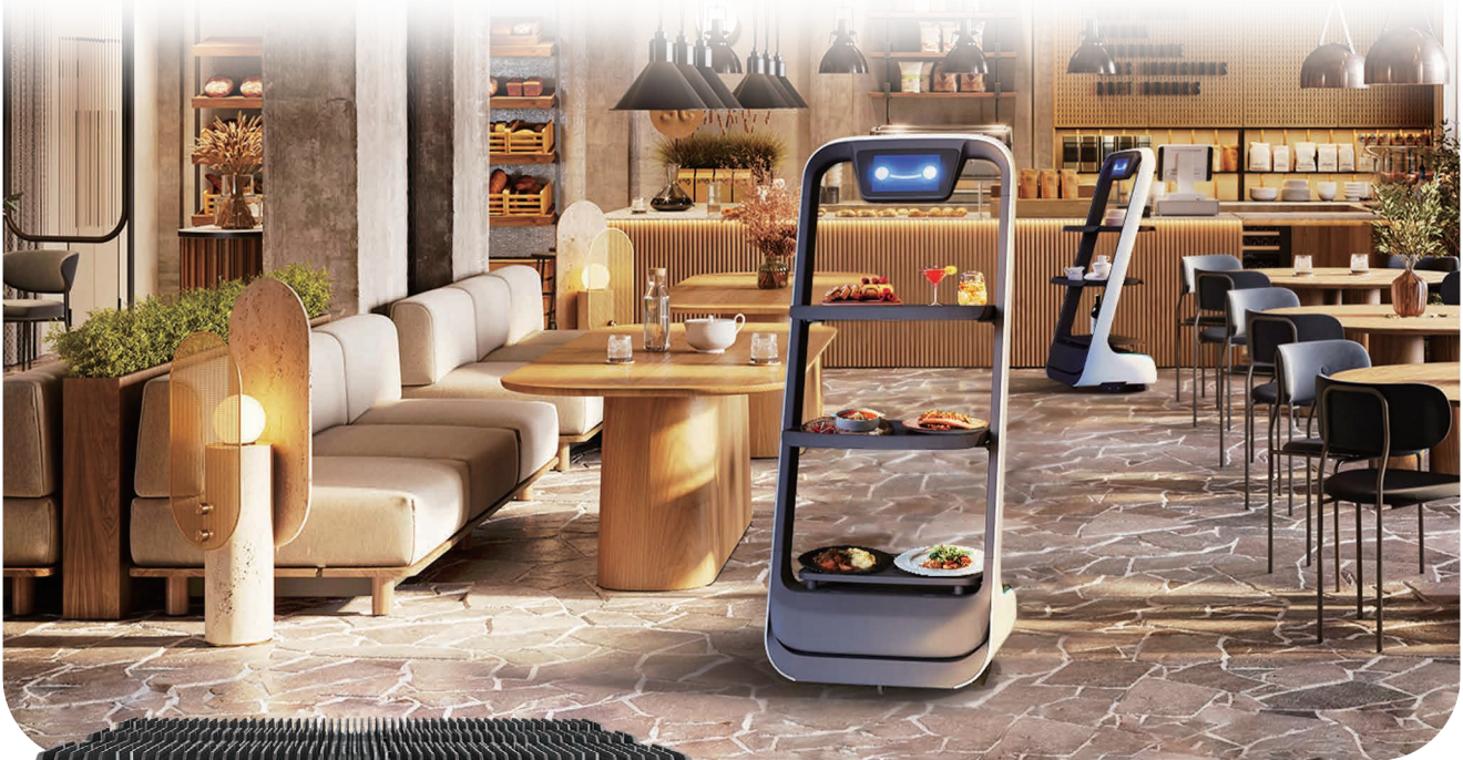
^ Robot Waiter

Workstation-grade Expandable Fanless Embedded System