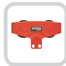
Mini Trolley TMH25 (for 60 - 240kg) Part No. 48350