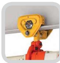
Push Trolley (for max. 480kg)