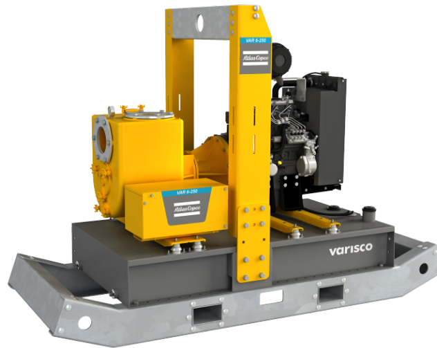
VAR 10-305 Liquid cooled engine