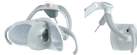
Faro Maia LED light (Made in Italy)