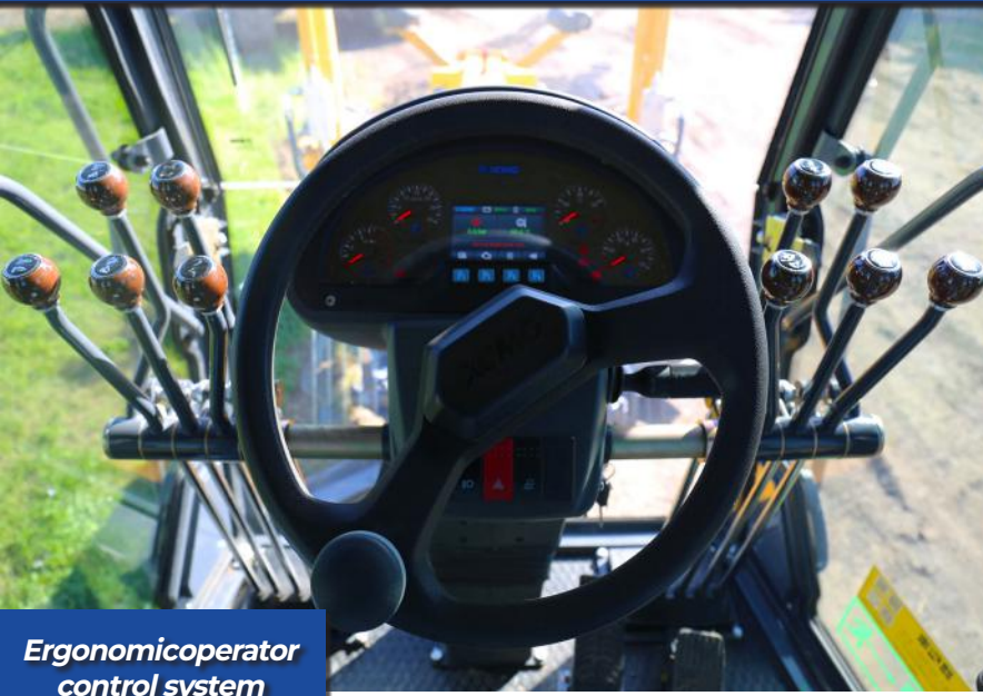
Ergonomic operator control system