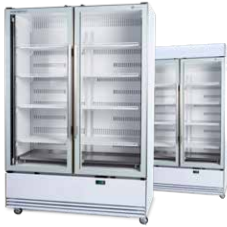
BME1200N-A & BME1200N-AC

Dimensions: 740 x 795 x 2005/2195 (AC) Total floor area: 0.63m 2 Weight: 185kg