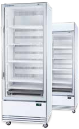
BME600N-A & BME600N-AC

Dimensions: 740 x 795 x 2005/2195 (AC) Total floor area: 0.63m 2 Weight: 185kg