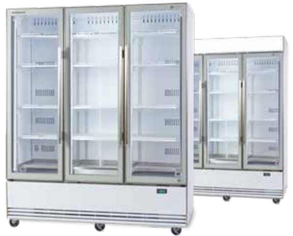
BME1500-A & BME1500-AC

Dimensions: 1280 x 795 x 2005/2195 (AC) Total floor area: 1.08m 2 Weight: 245kg