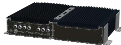
▲ SEMIL wall-mounted