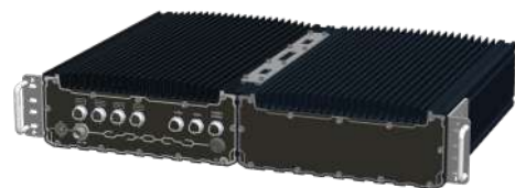
▲ SEMIL 19" rack-mounted