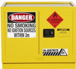
Under Bench Storage CAT NO: AU25748 2 shelves / Capacity 100 Litre