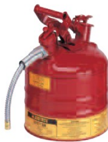
SAFETY DISPENSING CANS