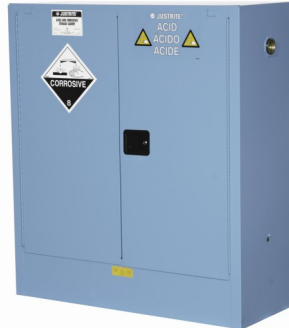
Storage Cabinet Cat No: AU25302B

3 shelves / 3 Polyethylene Trays Capacity: 250 Litre / 9 x 20 Litre Drums