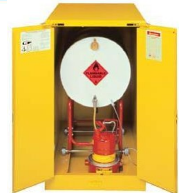
Drum Storage CAT NO: AU25662 207 Litre Horizontal Drum 2 Door