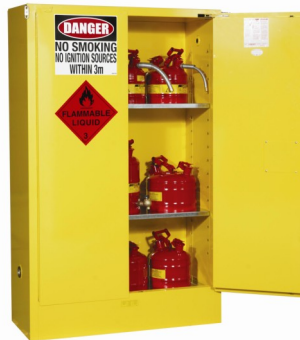
Safety Can Storage CAT NO: AU25452 3 shelves / Capacity 250 litre 9 x 20 Litre Drums