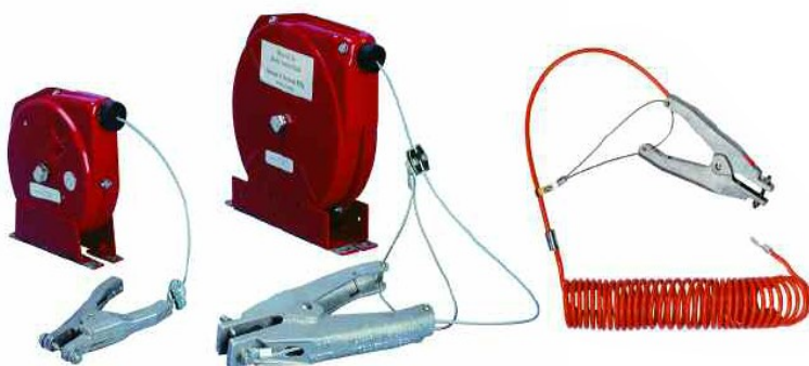
RETRACTABLE STATIC GROUNDING REELS