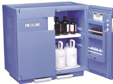
Polyethylene Storage Cabinet Cat No: AU24160

2 shelves / 3 Polyethylene Trays Capacity: 60 Litre