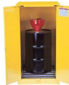
Drum Storage CAT NO: AU25701 207 Litre Vertical Drum 2 Door with Rollers