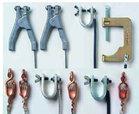
BONDING WIRE ASSEMBLIES