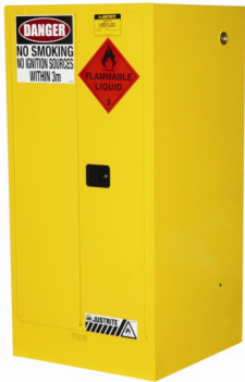
Safety Can Storage CAT NO: AU25602 3 shelves / Capacity 350 Litre 15 x 20 Litre Drums