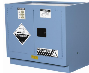
Storage Cabinet Cat No: AU25748B

2 shelves / 3 Polyethylene Trays Capacity: 160 Litre / 6 x 20 Litre Drums