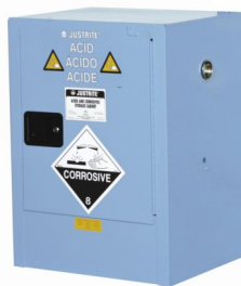
Storage Cabinet Cat No: AU25712B

2 shelves / 3 Polyethylene Trays Capacity: 60 Litre