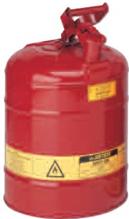
SAFETY STORAGE CANS

Fire protective storage of flammables. Heavy-duty with double-seamed construction. All models have built in flash arresters to eliminate the risk from flashback causing explosion.