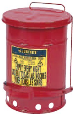
OILY WASTE CANS