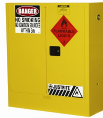
Safety Can Storage CAT NO: AU25302 2 shelves / Capacity 160 litre 6 x 20 Litre Drums