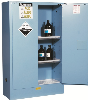
Storage Cabinet Cat No: AU25452B

3 shelves / 3 Polyethylene Trays Capacity: 250 Litre / 9 x 20 Litre Drums