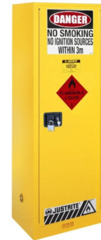
AU25304 & AU25308 Slim Line Storage Cabinets Single Door Capacity / 110 & 170 litre