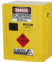
Compac Storage CAT NO: AU25714 2 shelves / Capacity 30 Litre