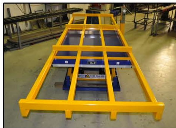
Custom MDF / Timber frame top scissor lift table