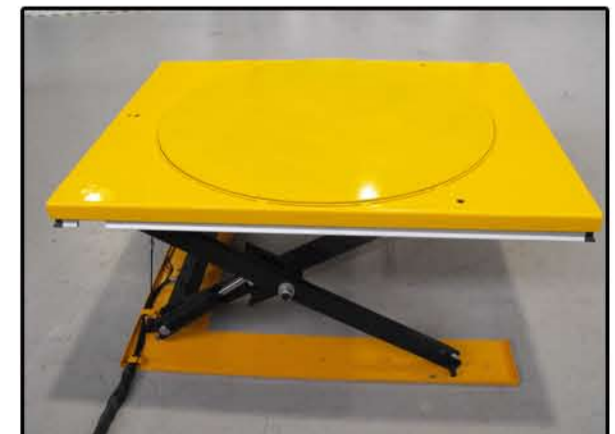
Custom low profile with recessed turntable

If you require specific advice on material handling solutions, let us help you make the right decision. Whether it be from our Australian production items or our import lines, we are dedicated to use our industry specific knowledge to provide a materials handling solution to help you.