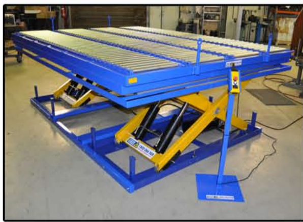
Custom dual scissor with conveyor top