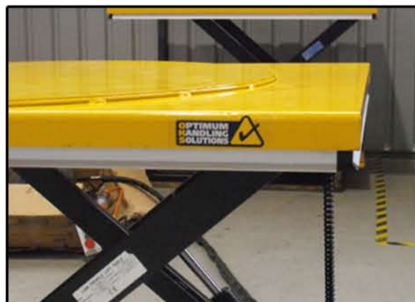
Custom Low Profile table with recessed turntable top