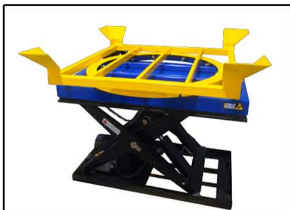
Custom scissor with stillage top