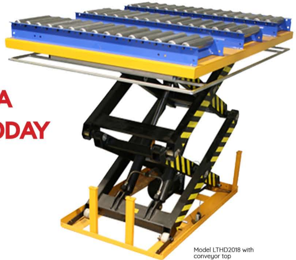
Model LTHD2018 with conveyor top