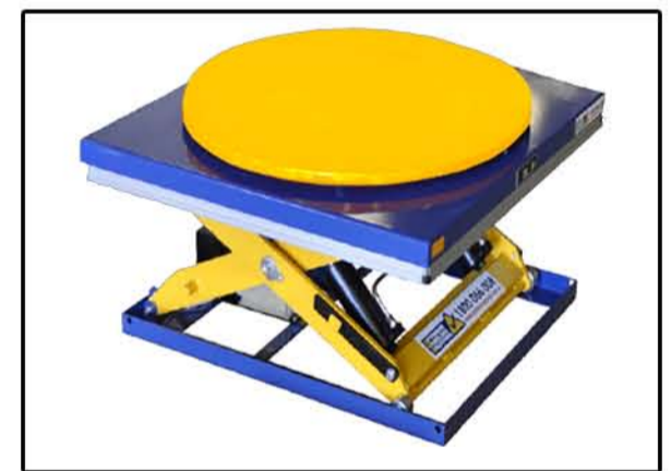
Custom scissor lift table with rotating turntable top