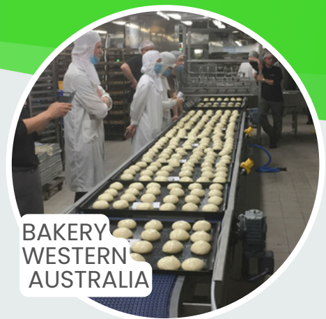
BAKERY WESTERN AUSTRALIA