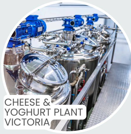
CHEESE & YOGHURT PLANT VICTORIA