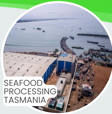
SEAFOOD PROCESSING TASMANIA