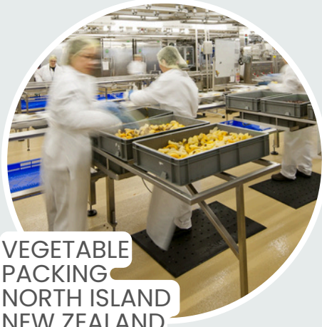
VEGETABLE PACKING NORTH ISLAND NEW ZEALAND