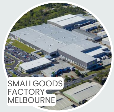
SMALLGOODS FACTORY MELBOURNE