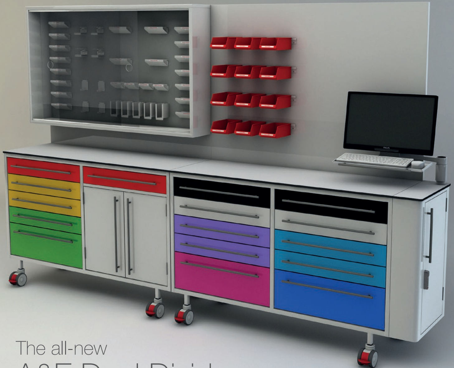
The all-new A&E Dual Divider