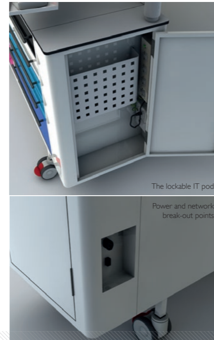
The lockable IT pod