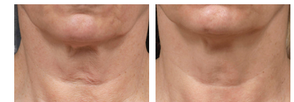
BEFORE 1 MONTH POST 2 TREATMENTS

All Before and After photos have not been retouched and represent patients who have had significant results. Individual results may vary based on the aggressiveness of treatment and skin condition.