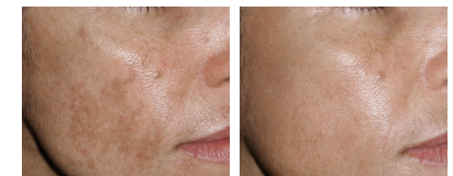
BEFORE 2 MONTHS POST 4 TREATMENTS