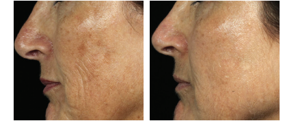
BEFORE 1 MONTHS POST 2 TREATMENTS