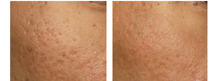
BEFORE 3 MONTHS POST 5 TREATMENTS