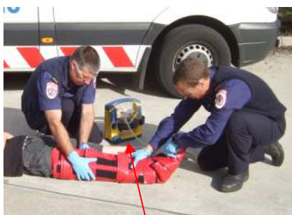
Evacuate air with battery powered suction unit