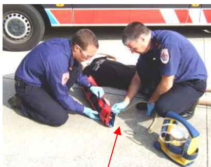
Connect the LSU Suction Pump

Officer 1 finishes applying the velcro strapping by applying the velcro strap over the hand.