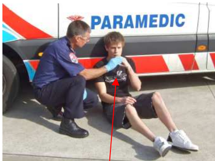
Assess patient and provide pain relief