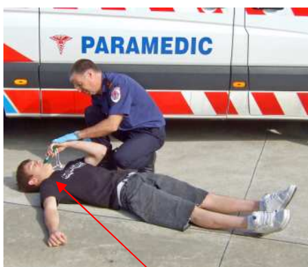
Provide appropriate pain relief

Officer 1 assesses patient as per the section 'Field Use Of The Vacuum Splint' on page 8 of this manual.