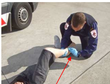
Assess neurovascular function

Officer 2 takes support of the limb and removes footwear and leg clothing to properly perform a neurovascular assessment below the level of injury, and to allow proper visual examination of the injury.