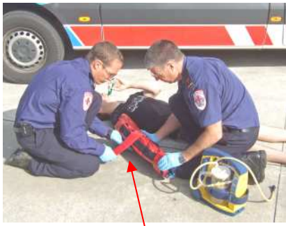
Retighten velcro straps until the splint is comfortable and supportive