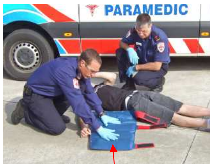
Place splint next to patient and ensure beads are evenly spread