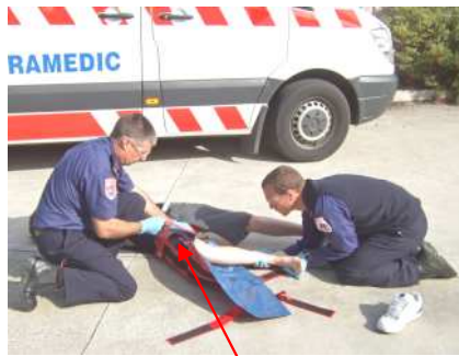
Apply the velcro straps from the pelvis to foot