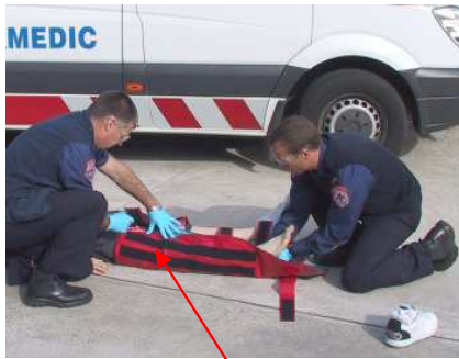
Apply the velcro straps from the pelvis to the foot