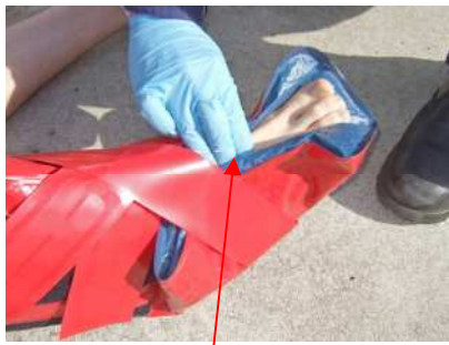
Recheck neurovascular observations post splint application

Officer 1 re-secures the velcro straps to ensure the splint is comfortable and supportive on the limb.