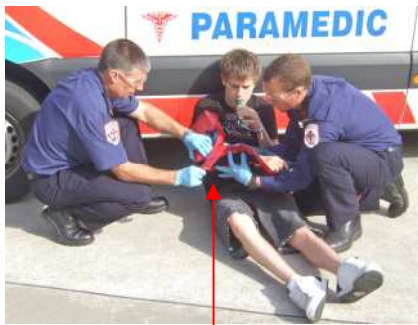
Continue to apply velcro straps to the lower arm