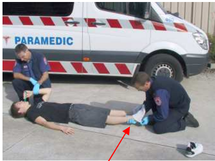
Remove footwear and leg clothing