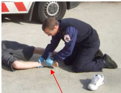
Assess neurovascular function

Officer 2 takes support of the limb and removes footwear and leg clothing to properly perform a neurovascular assessment below the level of injury, and to allow proper visual examination of the injury sight.