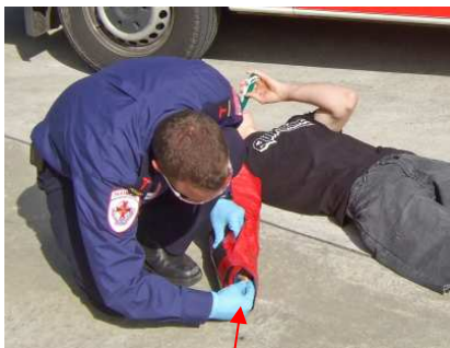
Recheck neurovascular observations post splint application

Officer 1 re-secures the velcro straps to ensure the splint is comfortable and supportive on the limb.