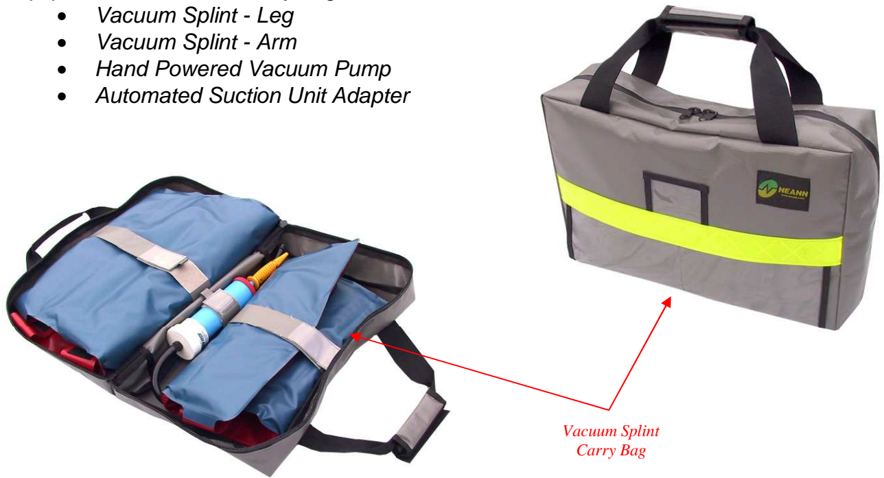
Vacuum Splint Carry Bag