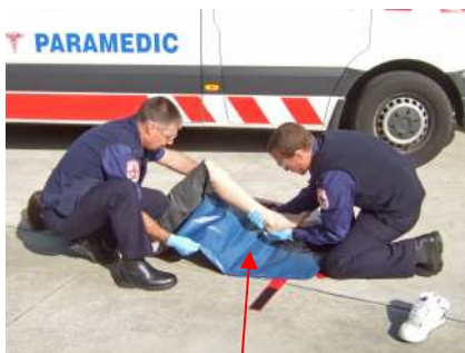
Centre splint under leg

Officer 2 continues to maintain support of the limb.