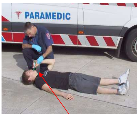
Provide appropriate pain relief

Officer 1 assesses patient as per the section 'Field Use Of The Vacuum Splint' on page 8 of this manual.