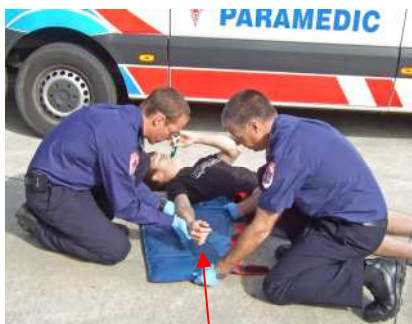
Centre splint under arm

Place splint next to patient with blue surface facing upwards and ensure beads are evenly spread throughout splint.