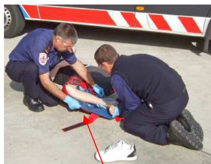
Bend splint around the knee and centralise under the lower leg

Officer 2 continues to maintain support of the limb.