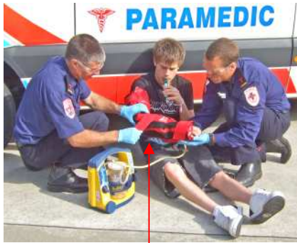
Retighten velcro straps until the splint is comfortable and supportive