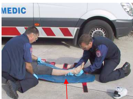
Centre splint under leg

Officer 2 continues to maintain support of the limb.