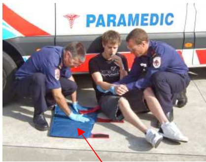
Place splint next to patient and ensure beads are evenly spread