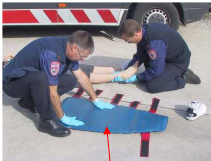
Place splint next to patient and ensure beads are evenly spread

Officer 2 continues to maintain support of the limb.