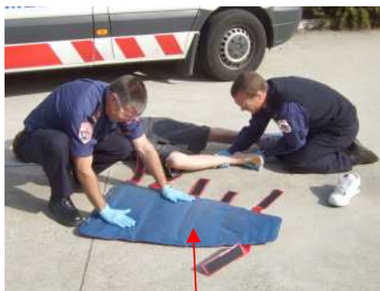
Place splint next to patient and ensure beads are evenly spread

Officer 2 continues to maintain support of the limb.