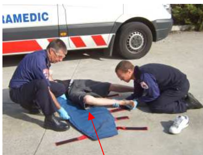
Centre splint under upper leg

Officer 2 continues to maintain support of the limb.