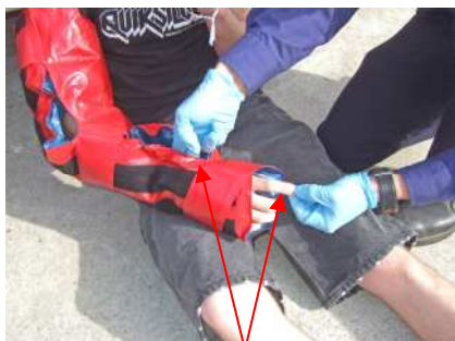
Recheck neurovascular observations post splint application

Officer 1 re-secures the velcro straps to ensure the splint is comfortable and supportive on the limb.