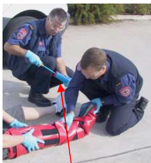
Evacuate air with hand pump