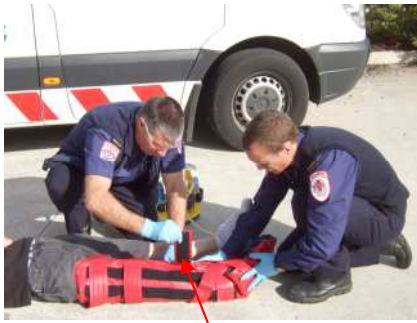
Retighten the straps until the splint is comfortable and supportive