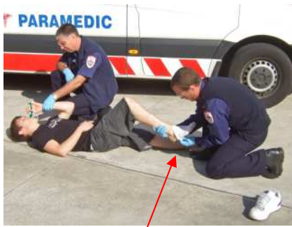
Remove footwear and leg clothing