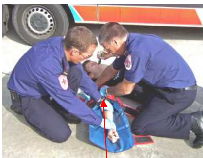
Apply the velcro straps from the shoulder to hand

Officer 2 maintains support of the limb.