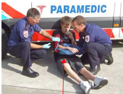
Bend splint around the elbow and centralise under the lower limb