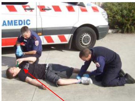
Provide appropriate pain relief & attempt to re-align limb

Officer 1 assesses patient as per the section 'Field Use Of The Vacuum Splint' on page 8 of this manual.