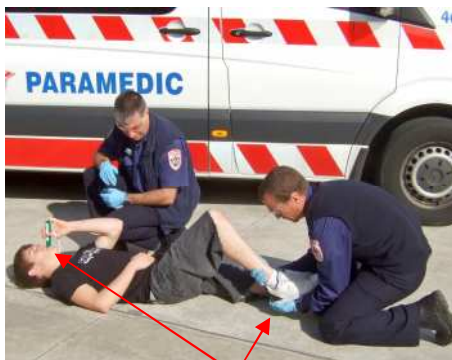
Provide appropriate pain relief whilst the limb is supported

Officer 1 assesses patient as per the section 'Field Use Of The Vacuum Splint' on page 8 of this manual.