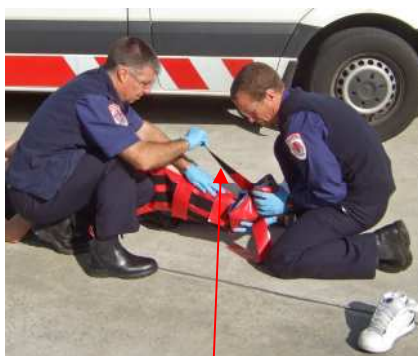
Apply figure of eight to support foot

Officer 2 continues to maintain support of the limb.