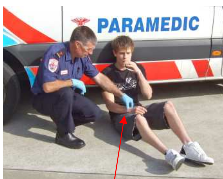
Assess neurovascular function below the injury

Irrigate open fractures with sterile isotonic solution and cover wound with a sterile dressing before moving the limb.