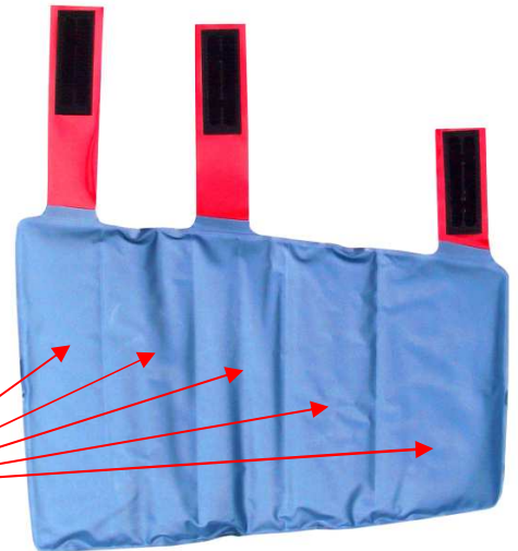
Unique Multi Chamber Design

The new patented inner lining system provides a configuration of overlapping multi-chambers preventing the beads from moving around and clumping together in comparison to other Vacuum splints on the market. By being placed across the width of the splint rather than the length like all other splints, beads remain better placed, require little spreading before application, and provide vastly improved rigidity.