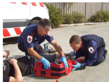
Evacuate air with battery powered suction unit

Officer 2 continues to maintain support of the limb.