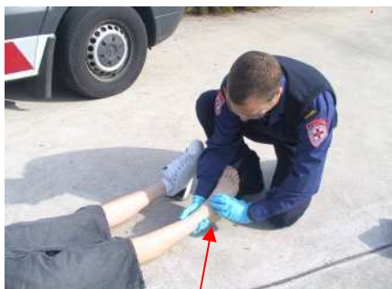
Assess neurovascular function

Officer 2 takes support of the limb and removes footwear and leg clothing to properly perform a neurovascular assessment below the level of injury, and to allow proper visual examination of the injury sight.