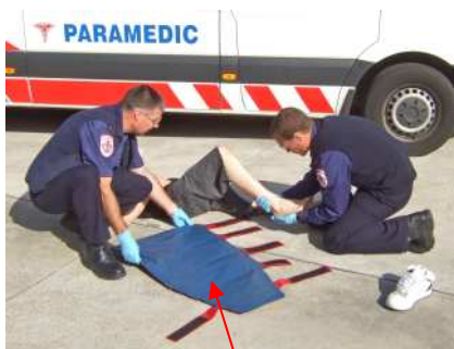
Place splint next to patient and ensure beads are evenly spread

Officer 2 continues to maintain support of the limb.