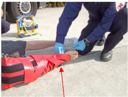
Recheck neurovascular observations post splint application

Officer 1 re-secures the velcro straps to ensure the splint is comfortable and supportive on the limb.