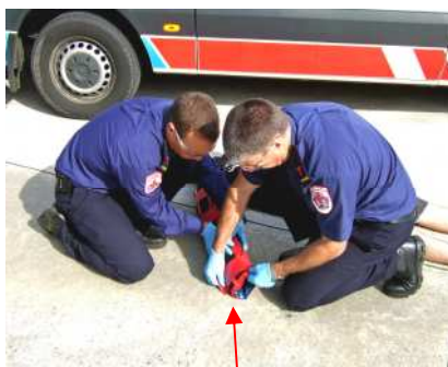
Apply velcro strap over hand

Officer 2 continues to maintain support of the limb.