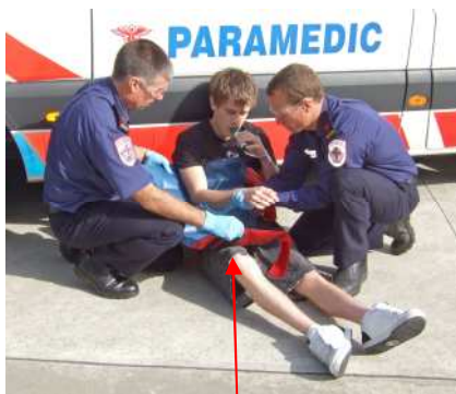
Centre splint under upper arm