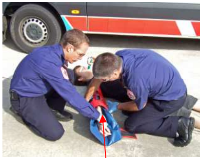
Apply middle velcro strap