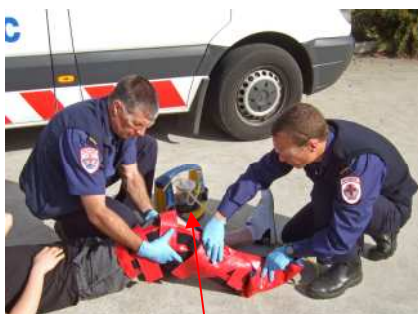
Evacuate air with battery powered suction unit

Officer 1 finishes applying the velcro strapping by applying the figure of eight foot straps to prevent foot movement.