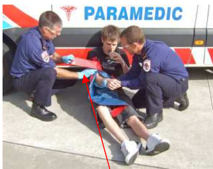
Apply the velcro straps from the shoulders to hand