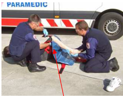
Apply the velcro straps from the pelvis to the foot