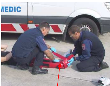
Apply figure of eight to support foot