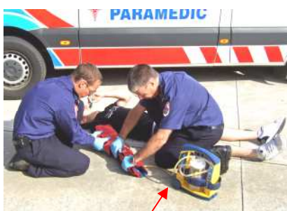
Evacuate air with battery powered suction unit

Whilst Officer 1 evacuates the air, Officers 2 and 3 hold the beads firmly against the patient's limb to ensure that as the air is evacuated, the beads stay firmly against the patient's limb.