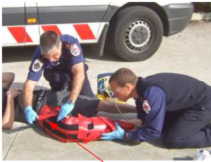
Retighten velcro straps until the splint is comfortable and supportive