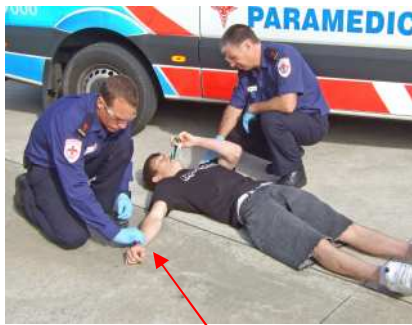
Assess neurovascular function