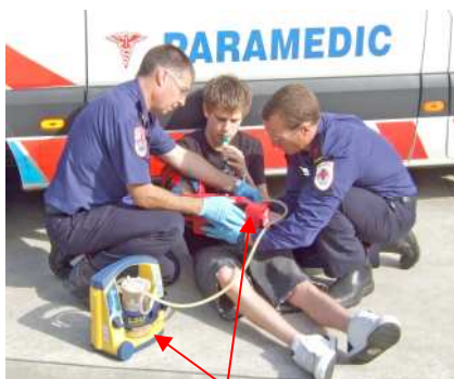
Connect the battery powered suction unit

Officer 2 continues to maintain support of the limb.