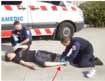
Remove footwear and leg clothing