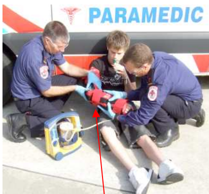
Evacuate air with battery powered suction unit

Whilst Officer 1 evacuates the air, Officers 2 and 3 hold the beads firmly against the patient's limb to ensure that as the air is evacuated, the beads stay firmly against the patient's limb.