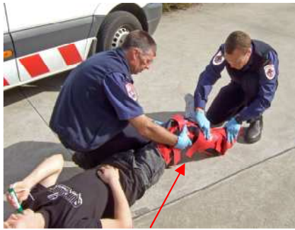
Retighten velcro straps until the splint is comfortable and supportive