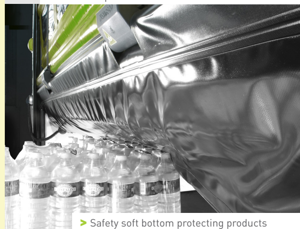
> Safety soft bottom protecting products