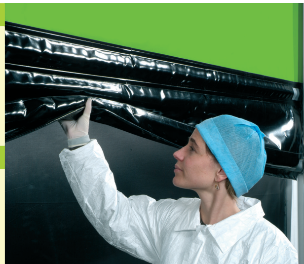
> Safety: intelligent curtain

The direct drive motor with proven reliability provides long lasting performance. This technology avoids the use of chains and reduces maintenance. General wear is reduced as the door operates with only 5 moving parts (motor, gearbox, limit switch, winding shaft, rotating sleeve).