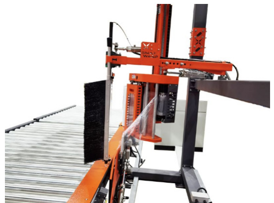
Powerful Film Clamp & Cut