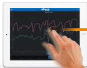
Jump Function 1. Click on arrow close to the value under test.