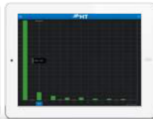
Current and voltage harmonics.