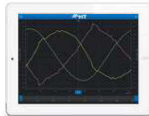
Voltage and current waveforms.

Wi-Fi connection allows you to display wave forms, vector diagrams, harmonics and all electrical parameters for each phase on your tablet/smartphone/PC.