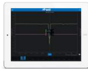
Zoom on voltage and current drop.

App HTanalysis makes it simple and clear. Using ZOOM Functions you can display all the recorded quantities. JUMP Function displays harmonics in any recording step just by clicking on the quantity.