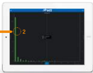
Jump Function 2. Go to real time harmonic values.

HTanalysis is available for free on AppStore™ or Playstore™