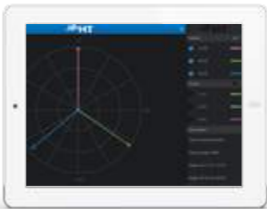
Voltage and current vector diagram.