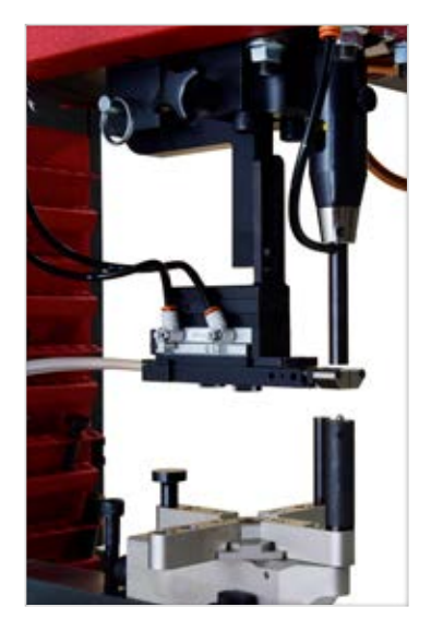
Manual Tooling J-Frame is used for small boxes and short reverse flanges

Automatic Bottom Feed J-Frame is used for those difficult to reach flanges