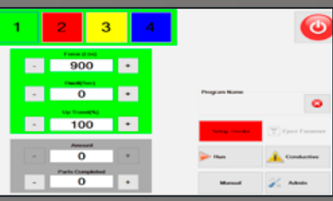
Single Station settings: Operators can set the Force, Dwell and Up Travel from this single station screen.

Multi-Station: Multi-Station is an option