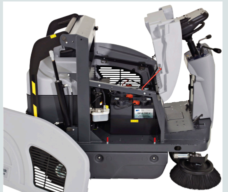
Maintenance is easy since no tools are needed for broom and filter removal and easy access to all components makes maintenance and service fast and easy