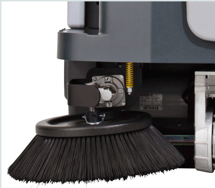
DustGuard™ misting system adds to the dust free sweeping improving the environment for operator as well as the surroundings (optional)