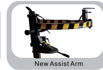
New Assist Arm