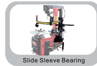
Slide Sleeve Bearing