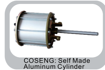
COSENG Self Made Aluminum Cylinder