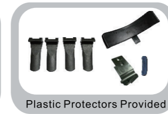
Plastic Protectors Provided