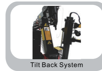
Tilt Back System