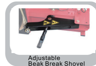
Adjustable Beak Break Shovel