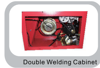
Double Welding Cabinet