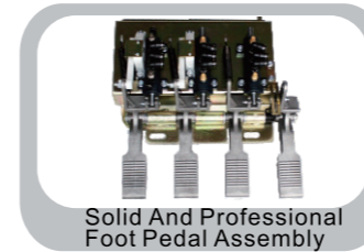
Solid And Professional Foot Pedal Assembly