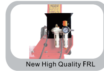
New High Quality FRL