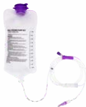
Enteral giving set (bag)