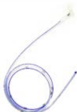
Enteral feeding catheter