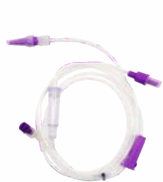
Enteral giving set (spike)