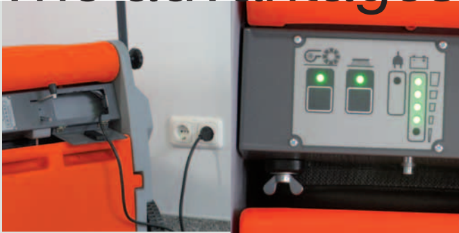
On-board charger to charge at any available plug socket. Most simple operation and clear information.