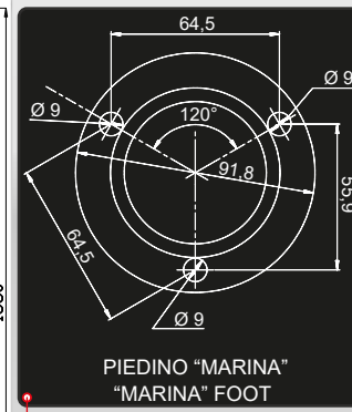
PIEDINO "MARINA" "MARINA" FOOT