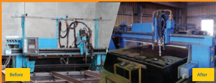
Machine Refurbishment/Retro-fitment Solutions

We offer more than just manufacture cutting-edge, world-class machines.