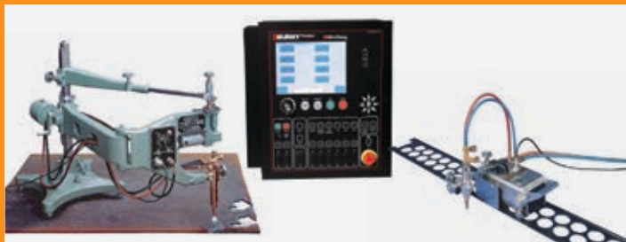
CNC Plasma & Gas Cutting Solutions