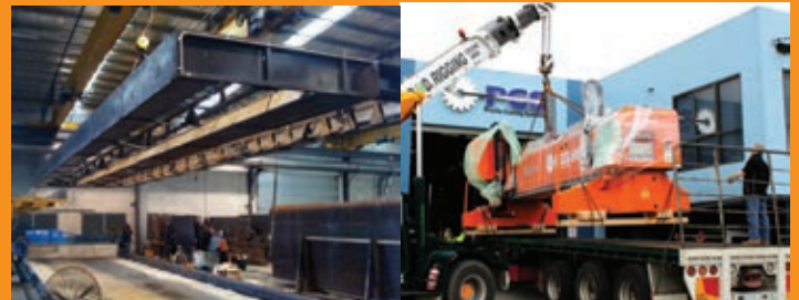
Machine Relocation Solutions