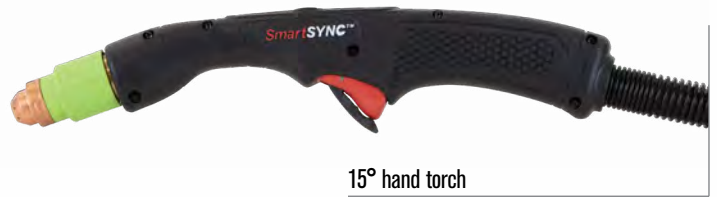
15° hand torch