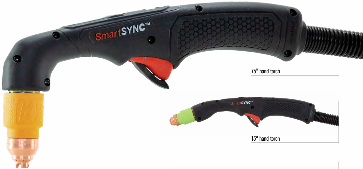
75° hand torch