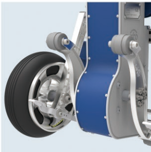
Support Wheels High-abrasive and anti-slip support wheels with polyurethane material