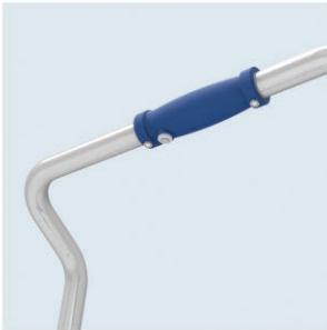
Run button Point touch operation button, easy to operate and ensure the safety