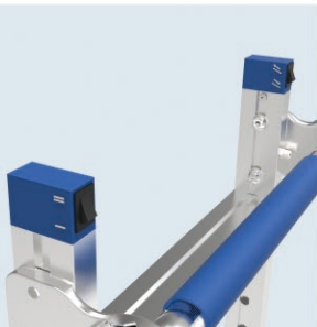
Upstairs/Downstairs Button Choose the up/down mode Fast/Slow Button Choose the speed