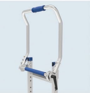
Handle Rotating operation, adjusting angle, folding, seeking the suitable angle