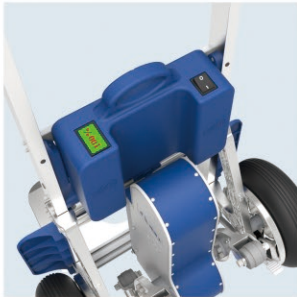
Battery Fast plug design, independent switch to safe, display capacity and voltage