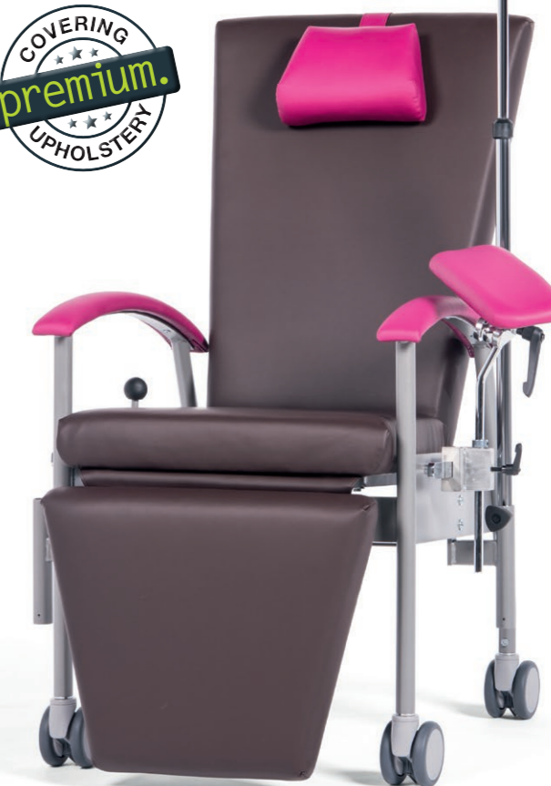
SITA in premium material chocolate/fuchsia with blood collection armrest on the standard rail and infusion rod in holder