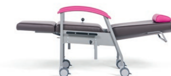
Bed position/Flat position