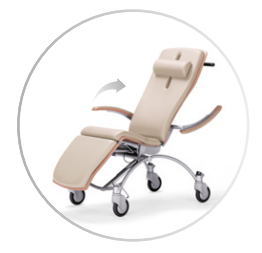
Armrests automatically adjusted to reclining position (foldable)