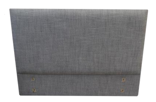
STEP 2: Place headboard in position (this may require two people)