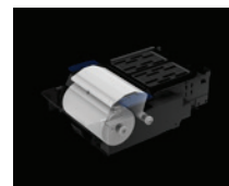
Integrated head wiper with user replaceable fabric roll.