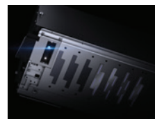
Advanced media set-up with automatic self adjustment